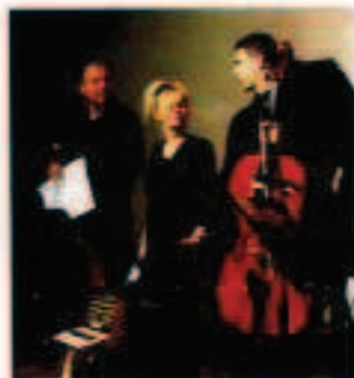
Pro Contemporania Ensemble received the “Prize of the journal Actualitatea Muzicala in Bucharest for promoting the new music”